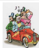
start the car

2. shut short more horse report snack back