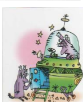
shut the door

2. shut short more horse report snack back