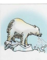
blow the snow

2. high night light fight bright sight might