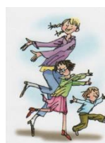
whirl and whirl