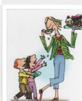
that's not fair

2. car head cheer pack smart right where work