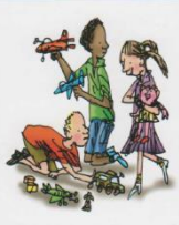
may I play?