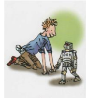
toy for a boy