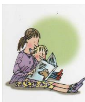
look at a book