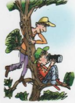
what can you see?

2. see three hear green year hear meat sleep fast